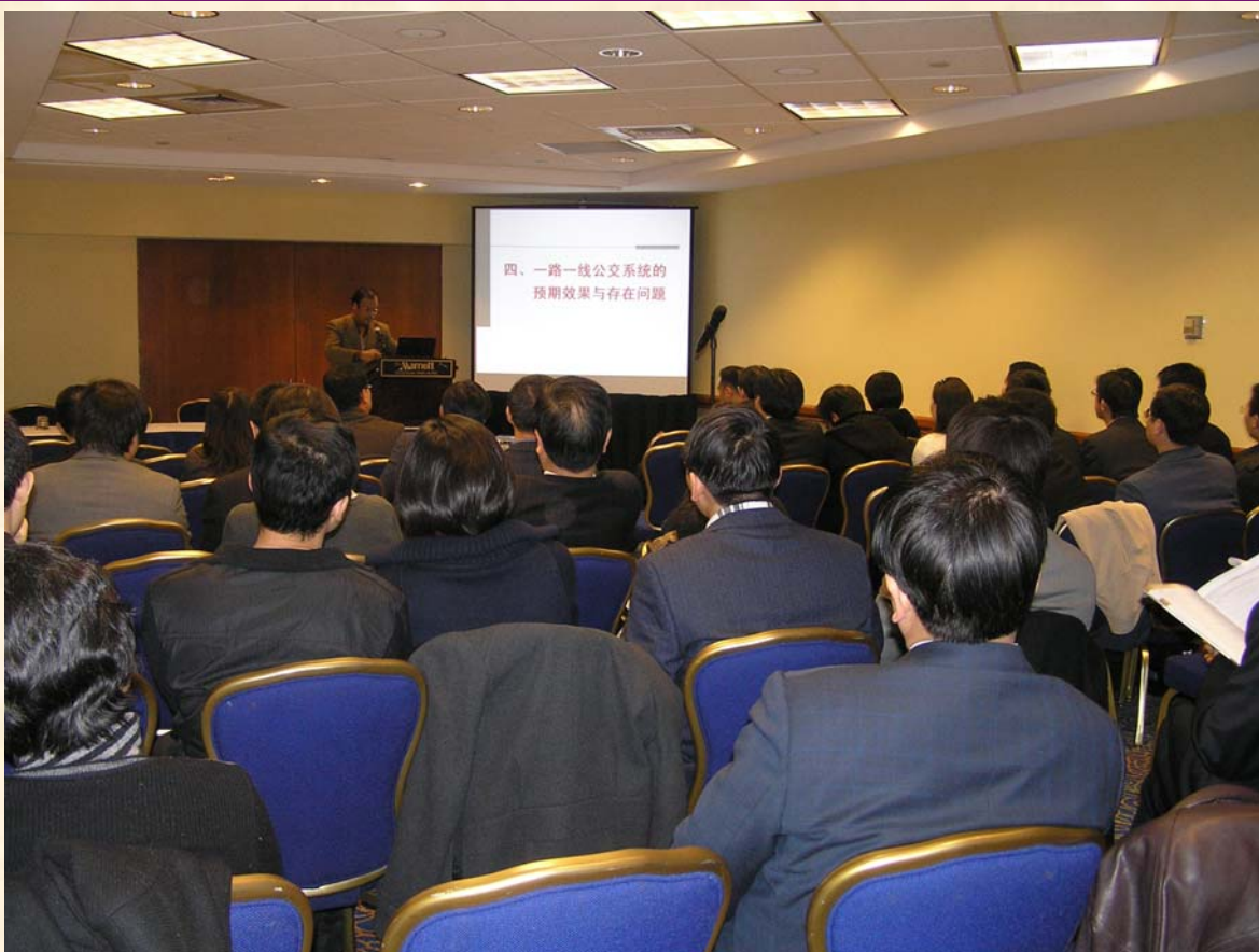
Symposium Conference Room