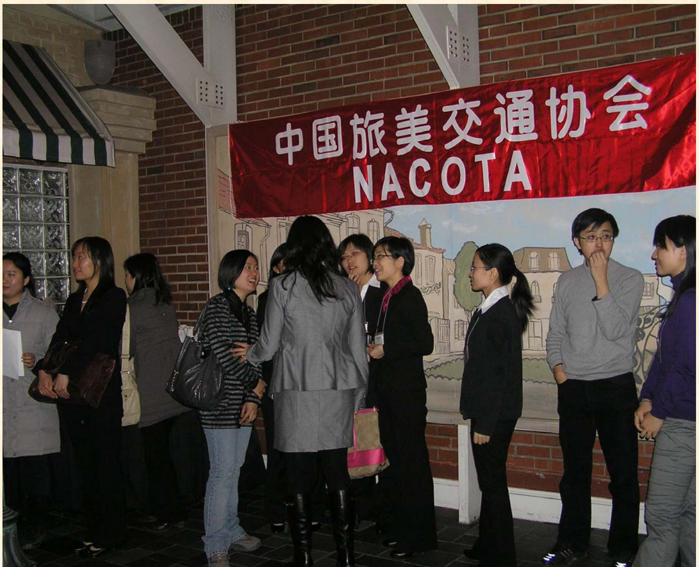
NACOTA Reception in Washington D.C.